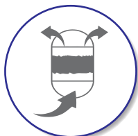
Intelligent cleaning Process